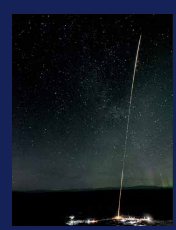
NASA LAUNCHES ROCKET INTO ACTIVE AURORAS, 2017

The global space community saw a record-breaking year in 2021, and Space Foundation's The Space Report delivered access to the people, data and research that explained the dynamic missions and investments taking place around the world.