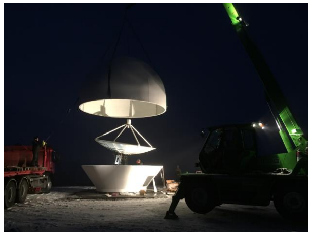
Exhibit 4: Unpacking of small antenna for SSC Infinity

As a complement to the launch service, SSC can provide automated and standardized ground network services for frequent, high capacity satellite data download and satellite tasking, SSC Infinity. We also offer launch and early orbit phase (LEOP) support, frequency coordination, cubesat propulsion systems and a "green" orbit raiser, high performant avionics for small satellites as well as mission planning, satellite design and procurement support.