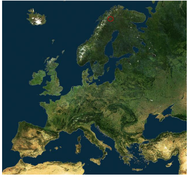
Exhibit 1: The location of Esrange Space Center