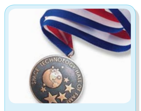
For further information on the ways in which space technology provides benefits here on Earth, visit the Space Technology Hall of Fame web site at www.spacetechhalloffame.org

Research associated with the development of the ISS, in particular, has contributed greatly to this phenomenon. For example, technology developed to recycle waste water on the ISS has led to the creation of a filtration system with the ability to purify