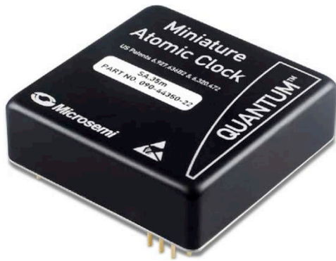
Figure 4 - SA33 Rubidium Oscillator