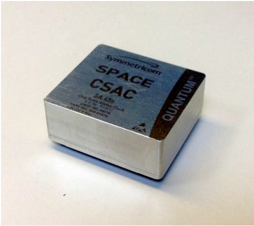
Figure 3 – Space CSAC

period and realized that performance in environments of up to 50 krad (Si) was reasonable by replacement of a radiation susceptible TCXO with a radiation tolerant device and increasing the shielding thickness . The paper presented on the Space CSAC is referenced at the end of this paper and provides a comprehensive summary of the oscillator.